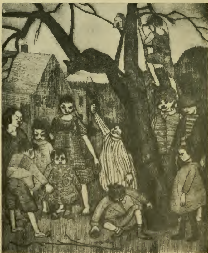
"THE TEASING ATTENTIONS OF ELEVEN YOUNG POLES"